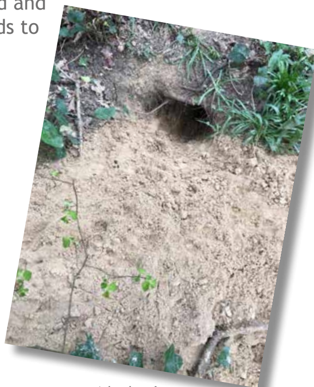
A badger's set