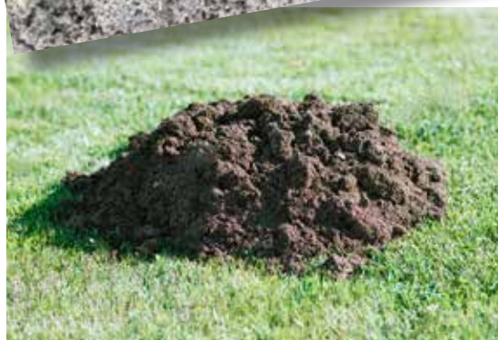
A mole hill