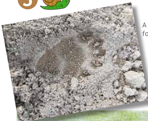
A badger's footprint